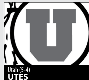
Utah (5-4) UTES

Date ..... Saturday, Dec. 12 Tip Time ..... 3 p.m. CST Radio ..... KOKC AM 1520 in OKC; ..... KMOD 97.5 FM in Tulsa; TV ..... Series ..... Versus OU leads 2-1 Last Meeting ..... OU won, 70-52 ..... Dec. 13, 2008, in Norman