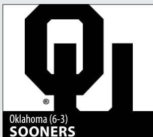
Oklahoma (6-3) SOONERS